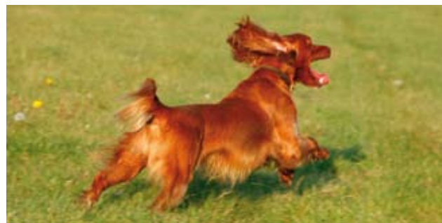
Feeding a balanced healthy diet with regular exercise and active weight management can make a huge difference to your pets mobility

ing the ends of the bones and formation of secondary new bone around the joint. Affected joints usually appear stiff, swollen and painful. Typical signs include: difficulty in getting to their feet after rest, and (for dogs) problems getting in and out of cars and often a reluctance to go on walks.